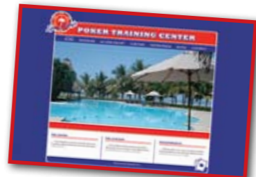
Poker and fun in the sun? Costa Rica may be the hot spot in 2010

I play a bit of limit Hold'em and I'm also considering dipping my toe into the world of pot-limit Omaha.