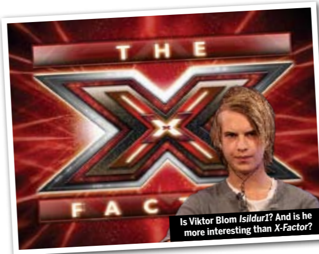
Is Viktor Blom Isildur1? And is he more interesting than X-Factor?