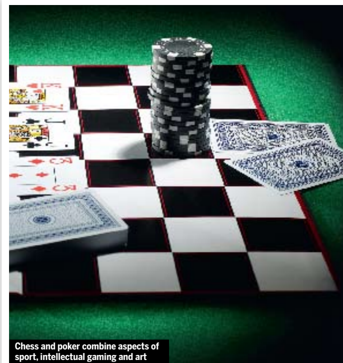
Chess and poker combine aspects of sport, intellectual gaming and art

It's a good point you make, Graham. For some reason, people are never happy unless they can fit something into a little box and slap a label on it. But try as they might, poker (and chess) will always defy simple definitions.